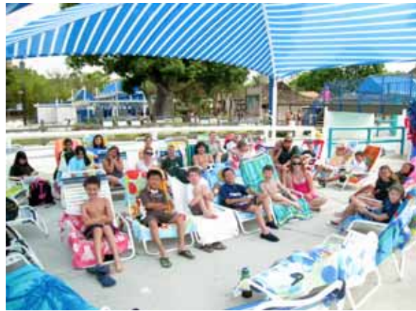
The Summer Camp group kicks back to relax under the cabana amidst their busy day at Wild Rivers. They had fun splashing, sliding and swimming at the famous Orange County water park.