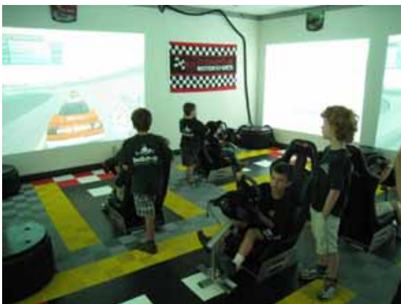
The boys root each other on as they zoom down the race track at Wowsville. The Summer Campers enjoyed the simulated racing room and the fairy tale dress-up room. They look forward to going to Wowsville again next summer!